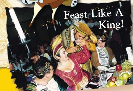
Feast Like A King!