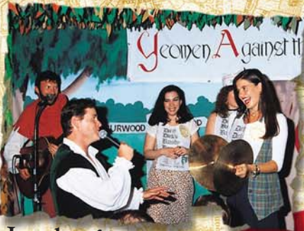
Loads of Fun!

At Dirty Dick's, we change our stage shows regularly. Whether you're a "first timer" or you've been before, there's always something new and fresh for you to enjoy. Be entertained by a host of historical—or should that be hysterical—characters, including the "Court Jester", "Queen Elizabeth I", "King Arthur", "Robin Hood" and "Friar Tuck" or "King Henry VIII". These are just some of the fabulous stage shows here at Dirty Dick's. Split your sides with laughter as you enjoy witty songs, whacky comedy, audience involvement, madcap games and, of course, our (in)famous bawdy songs and ditties.