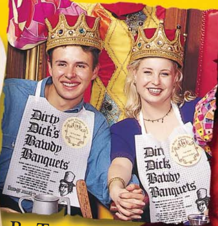
Be Treated Like Royalty!

Get Ready For A Great Night of Medieval Fun and Feasting!